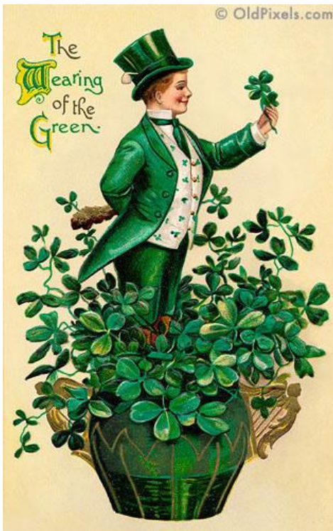
What's the difference between a Shamrock and a four leaf clover? Shamrocks have 3 leaves!