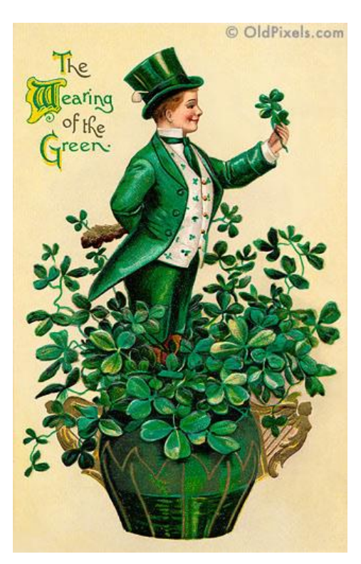
What's the difference between a Shamrock and a four leaf clover? Shamrocks have 3 leaves!